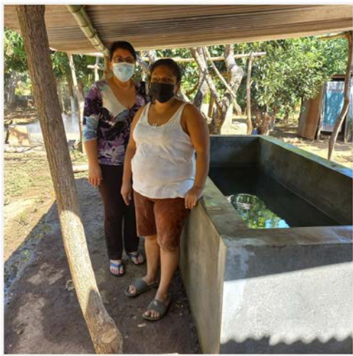
Axayacatl's rural development program for women and families.

But wait, there's even more to celebrate!