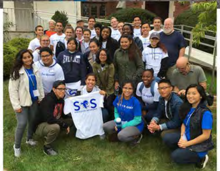
Normally, we wouldn't invite Pirates to pack a shipping container with tens of thousands of dollars in material aid...but we're proud that Seton Hall Pirates came out to help us pack on October 1st. Thanks you!